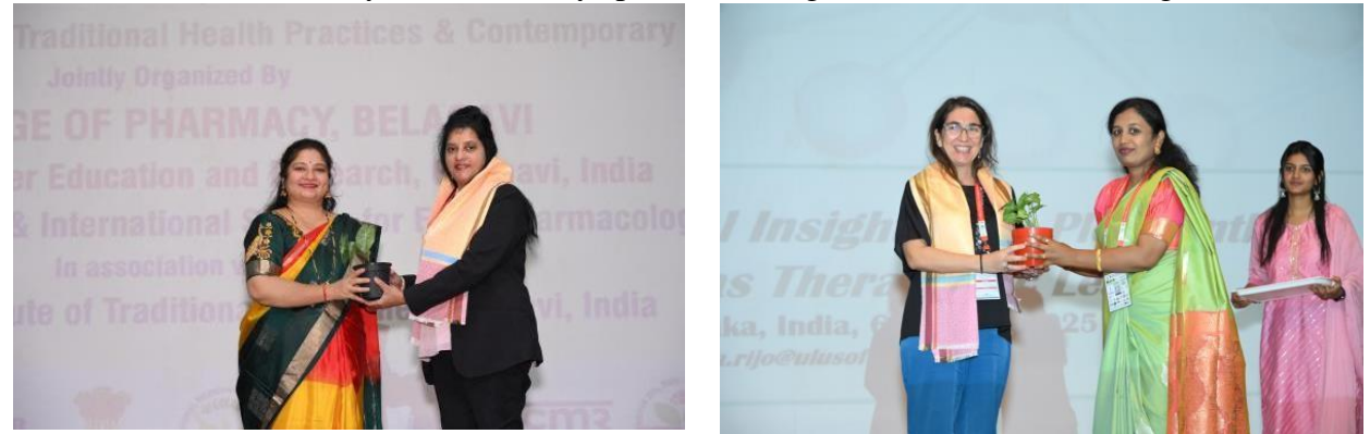
Felicitation of the keynote & Plenary speakers during the SFEC 2025 at Belagavi, India