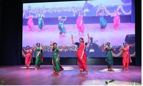
Cultural Program during the SFE 12th International Congress of SFE, (SFEC 2025)