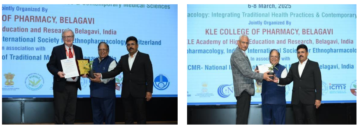
Felicitation of the keynote & Plenary speakers during the SFEC 2025 at Belagavi, India

Each plenary session was meticulously curated and expertly moderated, facilitating a seamless transfer of knowledge across generations and geographies.