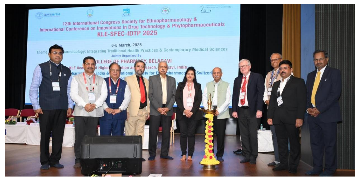
Inauguration and lighting of the inaugural lamp during SFEC 2025 at Belagavi, India

The 12<sup>th</sup> International Congress of the Society for Ethnopharmacology (SFEC 2025) was jointly organized by KLE College of Pharmacy, Belagavi, KLE Academy of Higher Education & Research, the Society for Ethnopharmacology Kolkata (India), in association with the Indian Council of Medical Research (ICMR) - National Institute of Traditional Medicine, Belagavi, India. This prestigious event took place from March 6<sup>th</sup> to 8<sup>th</sup>, 2025, at the KLE Centenary Convention Centre in Belagavi, Karnataka, India on the theme of "Ethnopharmacology: Integrating Traditional Health Practices and Contemporary Medical Science". The conference attracted international experts, academicians, researchers, and practitioners to discuss the intersection of ethnopharmacology, drug technology, and phytopharmaceuticals.