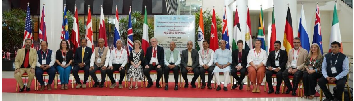
Dignitaries, Speakers of SFEC 2025 at Belagavi, India