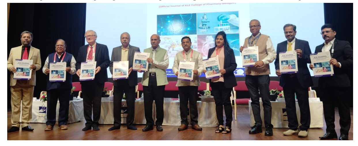
Inauguration of Conference proceedings of SFEC 2025 at Belgavi, India