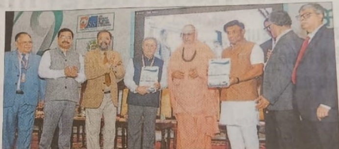
Health Minister Dr K Sudhakar releases a booklet during the inaugural ceremony of the 9th International Congress of Society of Ethnopharmacology at JSS Medical College in Mysuru on Friday. Former governor of Chhattisgarh Shekhar Dutt and Suttur Mutt seer Shivaratri Deshikendra Swami are seen.

A proper database is required. Unless there is adequate data, people will not believe it. The native healing methods should be passed on to the younger generation.