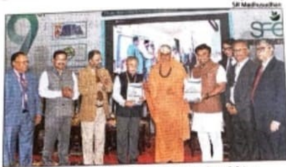
VALUING TRADITION: Health and medical education minister K Sudhakar on Friday inaugurated the ninth international conference of the Society for Ethnopharmacology at JSS Medical College in Mysuru

The minister, who inaugurated the ninth international conference of the Society for Ethnopharmacology organised by JSS Medical College,