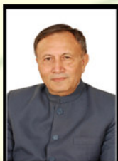
Shri Shekhar Dutt Former - Governor Chhattisgarh, India