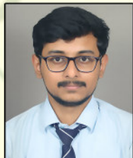
Mr. Barun Dasgupta Associates