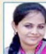
Mr. Seha Singha Associates