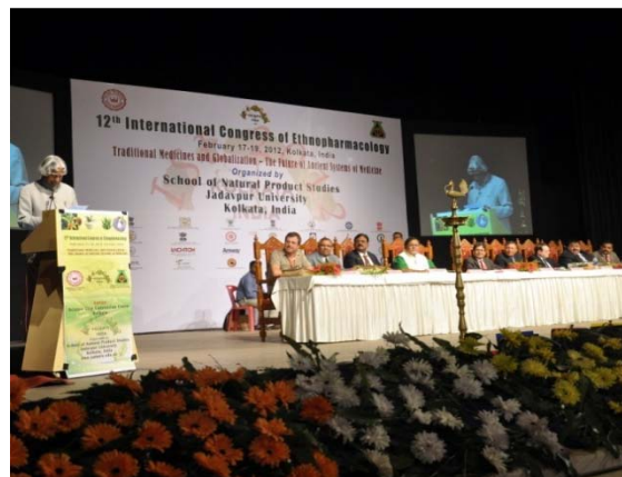
Special lecture delivered by Dr. APJ Abdul Kalam on "Dynamics on Ethnopharmacology" during 12 th Congress of the International Society for Ethnopharmacology, February 19-21, 2012

The Society for Ethnopharmacology, India is extremely grateful to Dr. APJ Abdul Kalam for his inspiration and support during its creation. After the grand success of the 12 th International Congress of International Society for Ethnopharmacology (ISE) on "Traditional Medicines and Globalization-Future of Ancient Systems of Medicine" organized by the School of Natural Product Studies, Jadavpur University Kolkata during February 17-19, 2012, SFE-India was formed by the eminent academicians, researchers, industrialists for promotion and development of Ethnopharmacology and Natural Product Research.