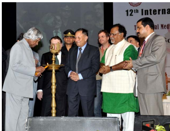
Inauguration during 12th International Society for Ethnopharmacology, February 19-21, 2012

Few memorable Glimpse of 12th International Congress of International Society for Ethnopharmacology (ISE)