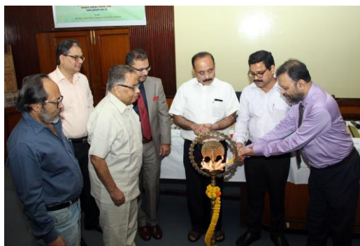
Inauguration of 3rd National Convention of SFE-India 2016