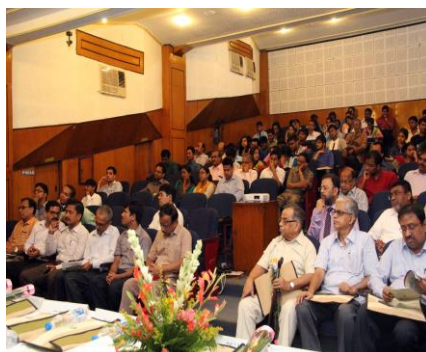
Participant and dignitaries of 3rd National Convention of SFE-India 2016