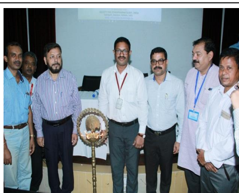
Inauguration of Ethnopharmacology Conclave during 4th Convention