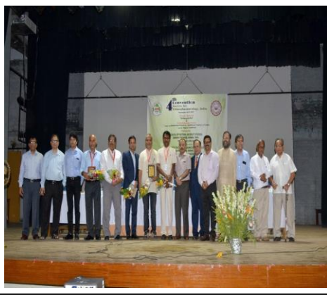
Inauguration of 4 th Convention: SFE-India 2017