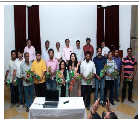
Valedictory Program of 4th Convention and