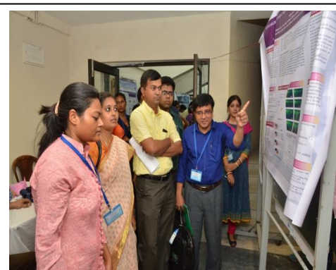
Poster Presentation Session