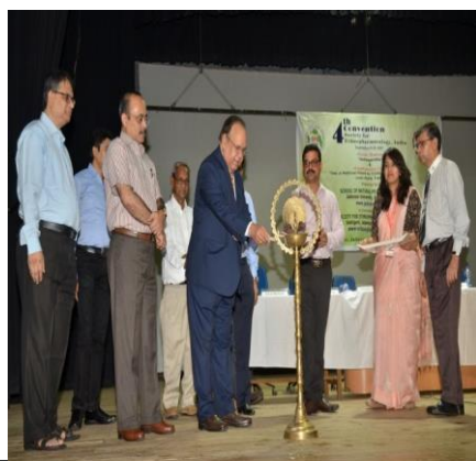
Inauguration of 4 th Convention: SFE-India 2017